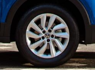
Belmont 16" alloy wheels (Standard on Highline)