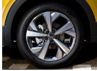
Cassino 17" alloy wheels (Standard on Topline)